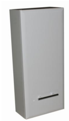
Pictured is a 720 x 300 Milan shaving cabinet

Metal door hinges - need to specify Left or Right handside hinges