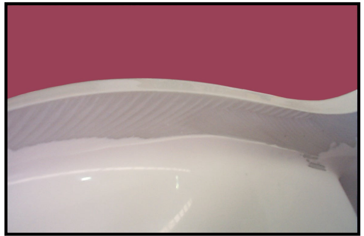
Diagram 2 (after)